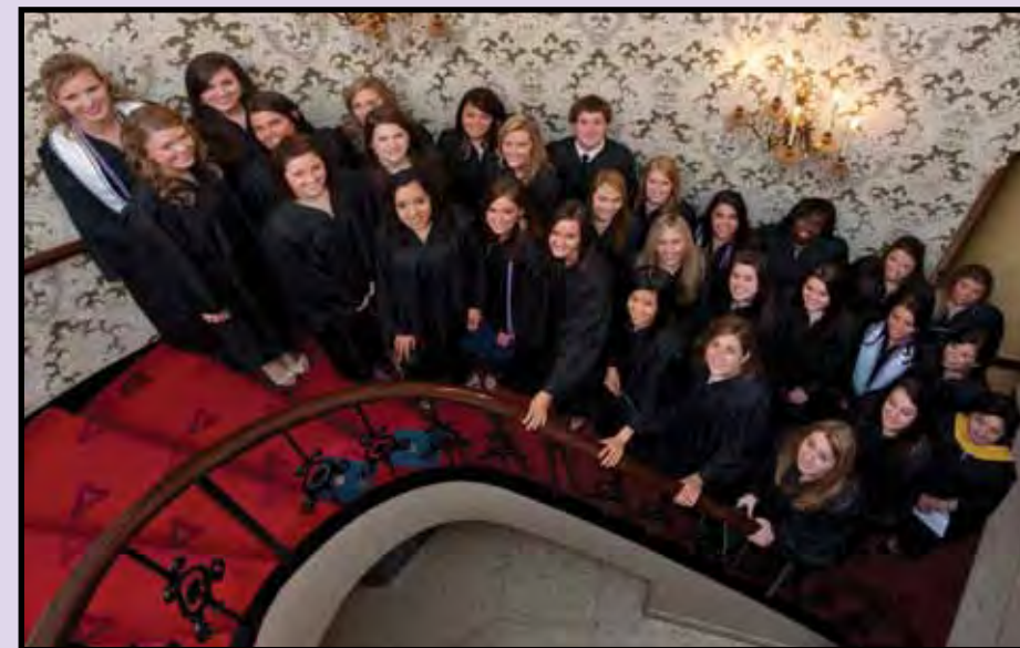
Dental Hygiene Class of 2011