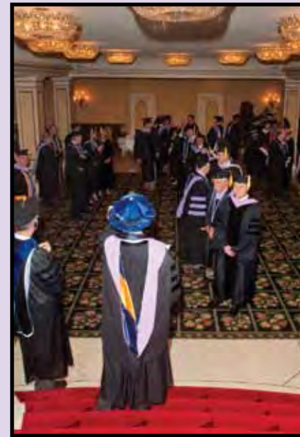
Before the ceremony