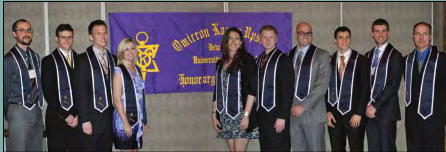
SDM inductees into the Beta Chapter of Omicron Kappa Upsilon, the National Honor Dental Society