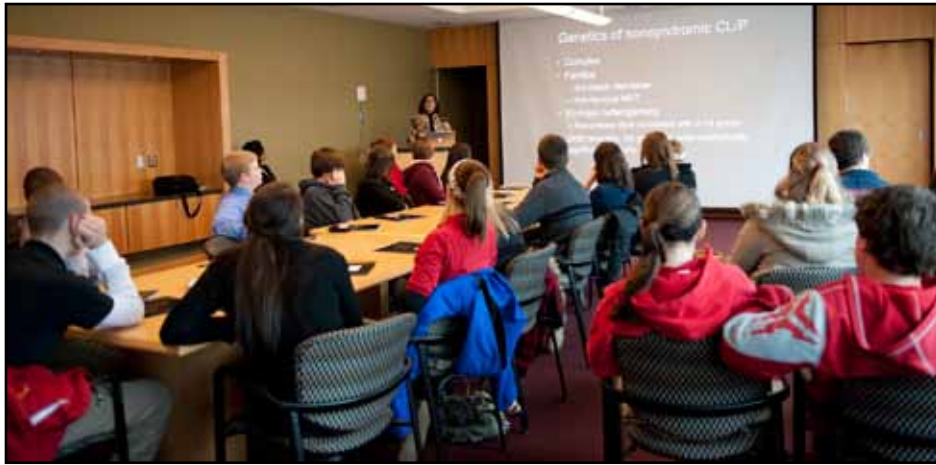
Students listen to faculty presentations as part of the GENA Project