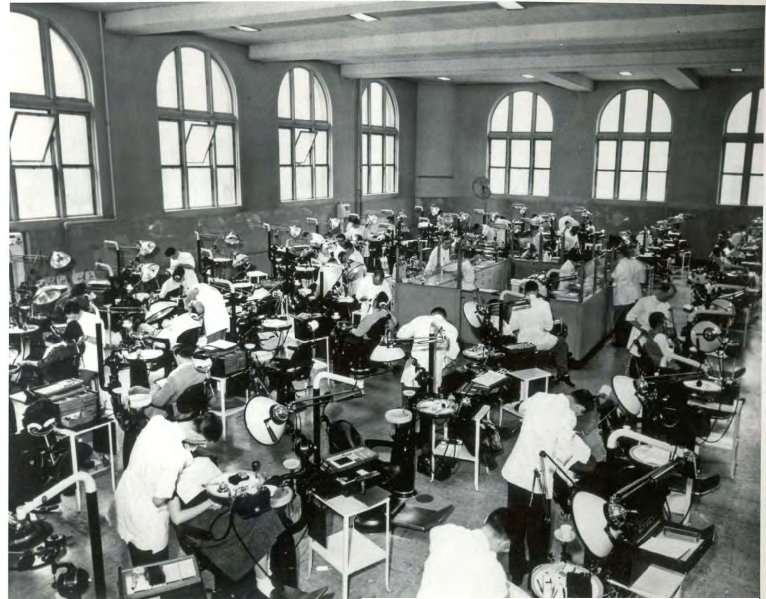
Dental Students in Thackeray Hall