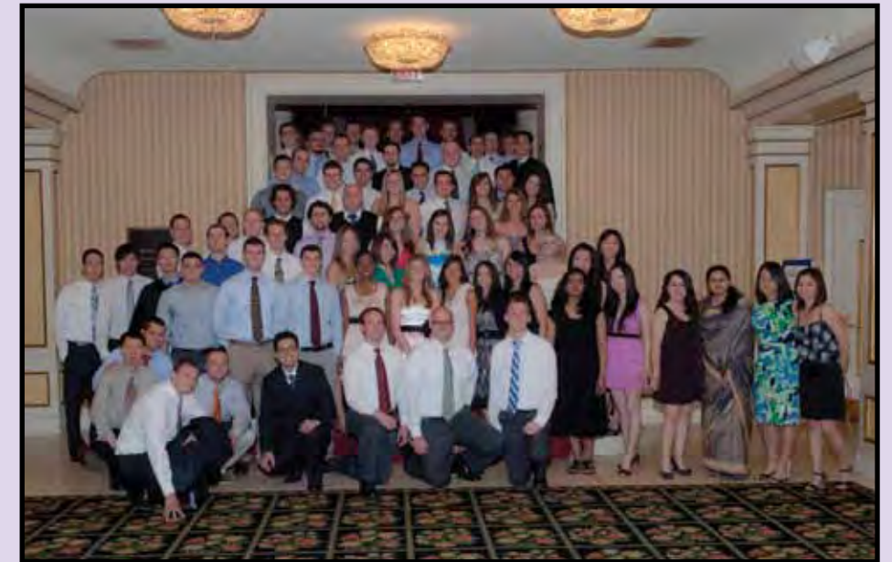
Dental Medicine Class of 2011