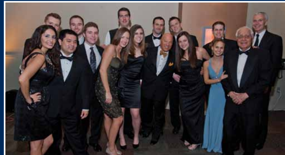
Delta Sigma Delta