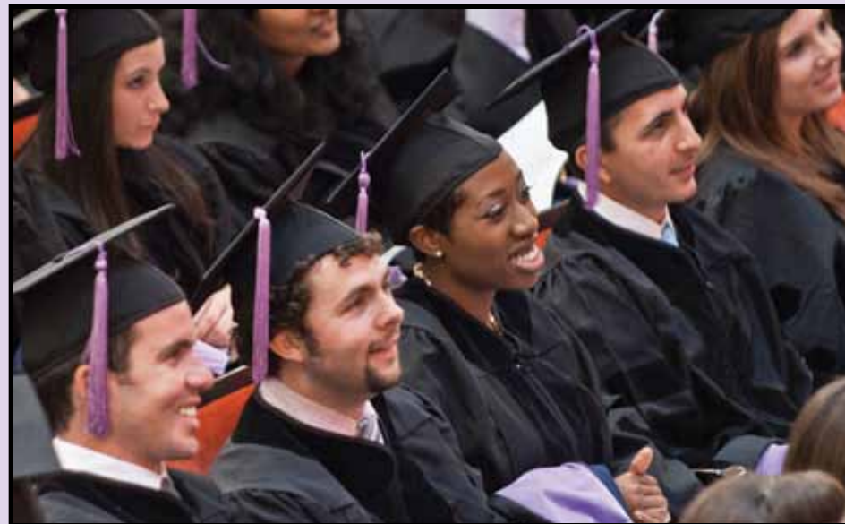
Class of 2011