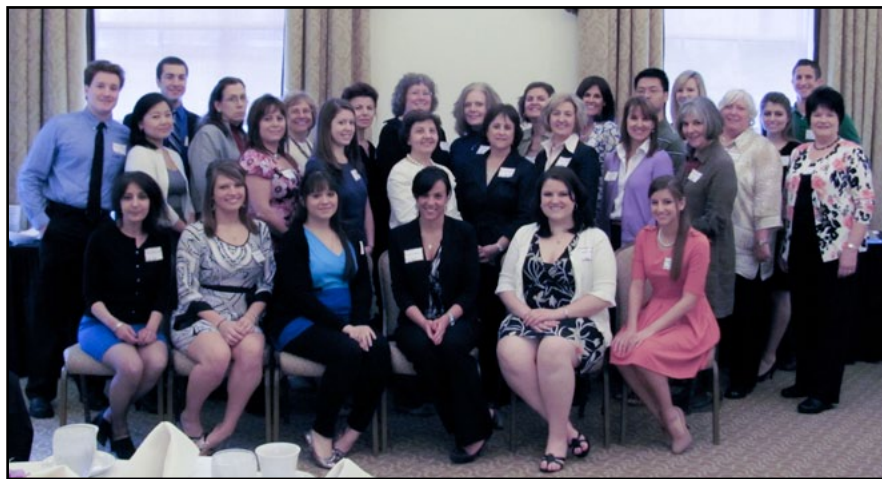
Dental Hygiene Luncheon

Thank you to all who attended the Dental Hygiene Alumni Luncheon after the T. F. Bowser Memorial Lecture in April. Graduates from the classes of 1965-2011 were in attendance at the event, with representation from every decade. Current dental hygiene students also attended the luncheon at the University Club, providing alumni with first-hand accounts of the changes the program has undergone in recent years. We also established a Dental Hygiene Alumni Committee at the luncheon that will focus on planning a celebration of the Dental Hygiene Program's upcoming 50th anniversary.