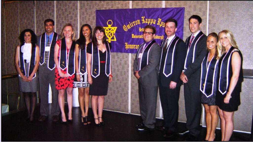
SDM inductees into the Beta Chapter of Omicron Kappa Upsilon, the National Honor Dental Society