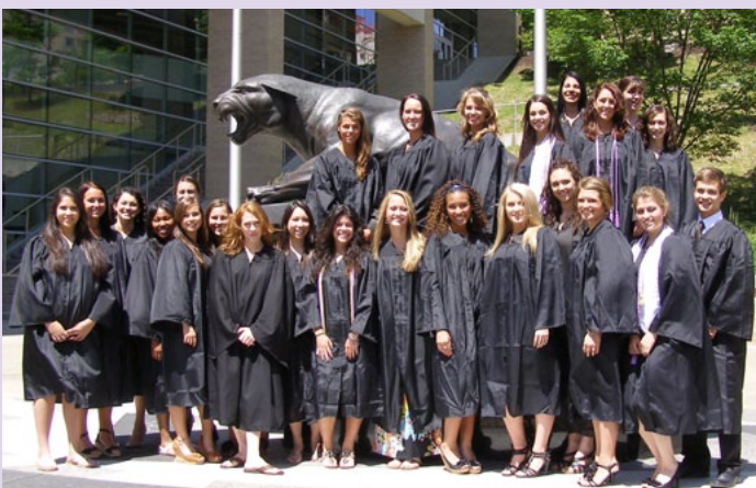
Dental Hygiene Class of 2012