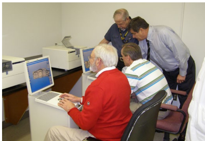
Faculty members receive training on the CEREC systems by a Sirona representative

This fall, the graduate prosthodontic residents will be taking a 15-week course designed specifically for CEREC technology use. In the future, the Department of Prosthodontics hopes to introduce the CEREC system to the second-year students in the pre-clinic fixed prosthodontic