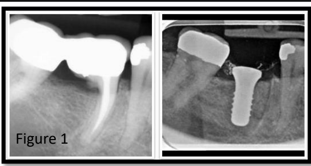
Figure 1. Extraction was delayed 17 years before implant placement. Figure 2. Recent case of preserving a tooth by removing just the affected root.

An Argument Against Extraction as a Treatment Alternative for Restorable Teeth that suggesting extraction as an option, among more conservative approaches, leads to a misconception that extraction is a treatment option as good as any other. Online forums such as <a href="Some teeth have more life:Options do exist">Some teeth have more life:Options do exist</a> have been used in our argument to bring this discussion to light. Two cases of single root removal of posterior teeth to postpone dental extraction show more conservative dentistry is still ideal.